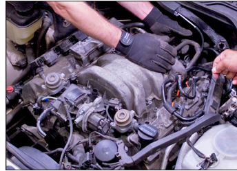
Bentley technical editors removing intake manifold on V6 (M 112) engine.