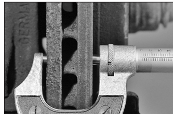
Measuring brake rotor wear. 00.04 Maintenance